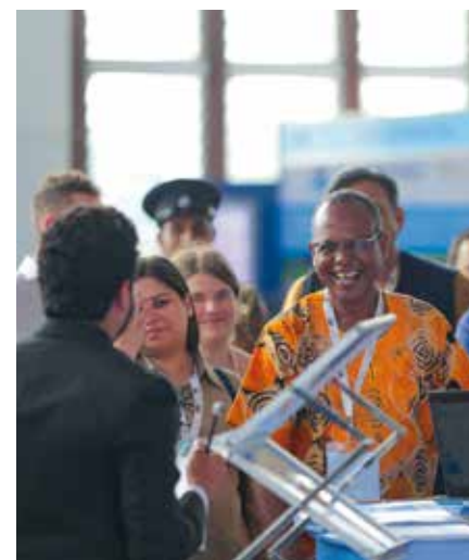
Networking in the exhibition area