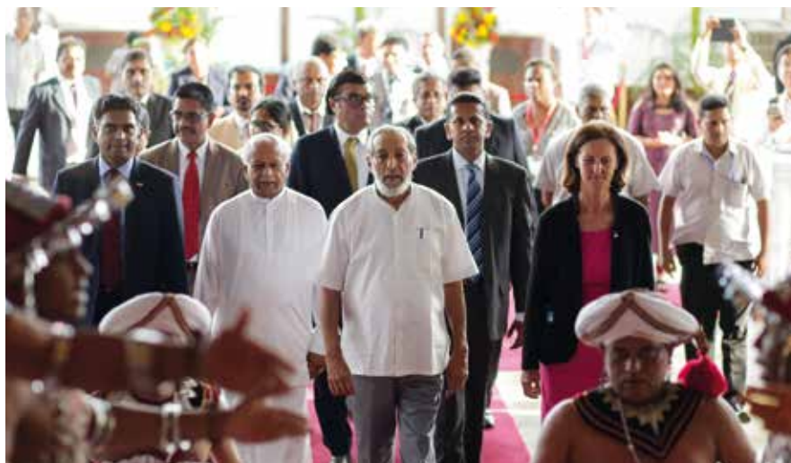
Official opening of the 2019 IWA Water and Development Congress & Exhibition