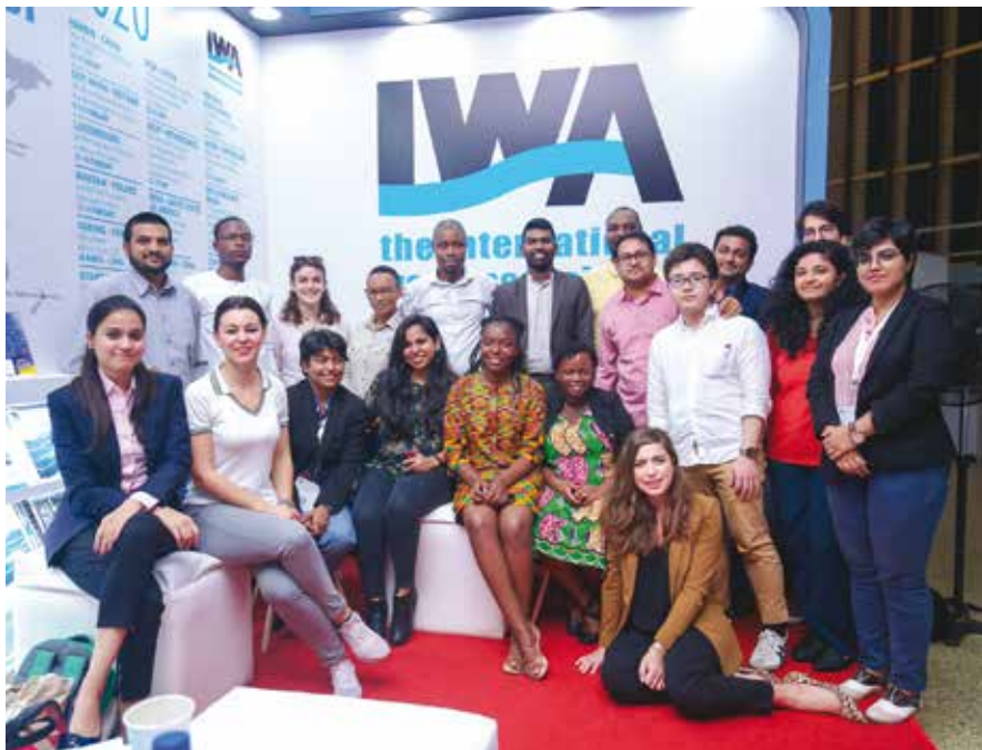
The Congress gained from the full and vibrant participation of Young Water Professionals